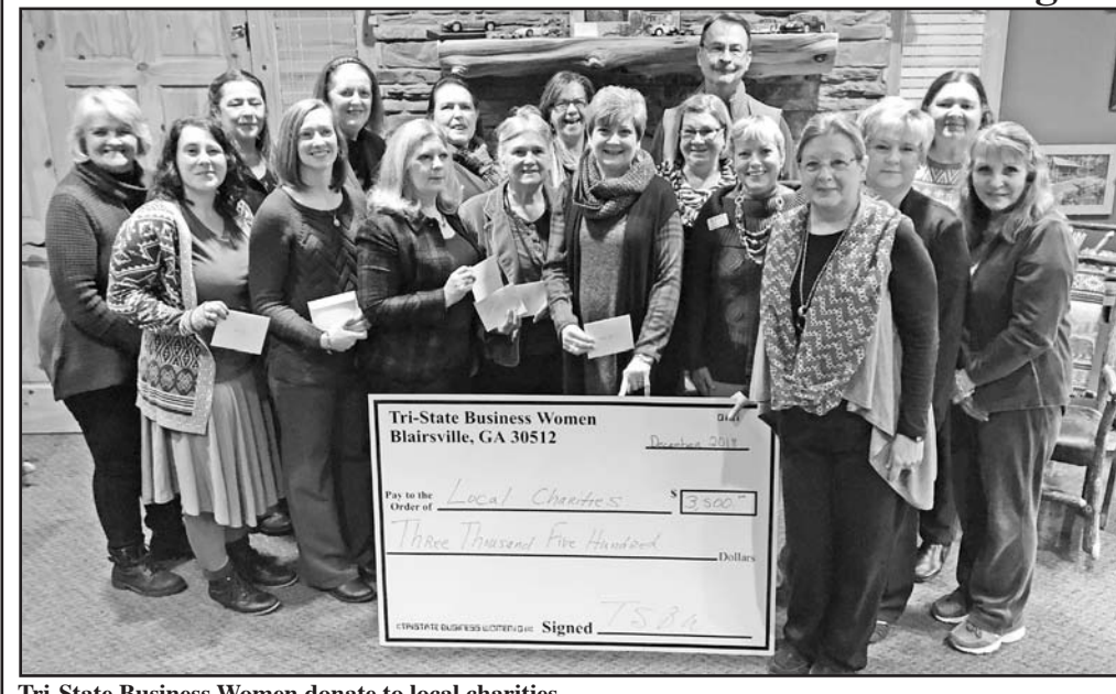
Tri-State Business Women donate to local charities

TSBW members were able to coordinate two successful fundraising events with the support of local businesses and residents. These events provided the opportunity to offer donations to local charities and scholarships to students within the area.